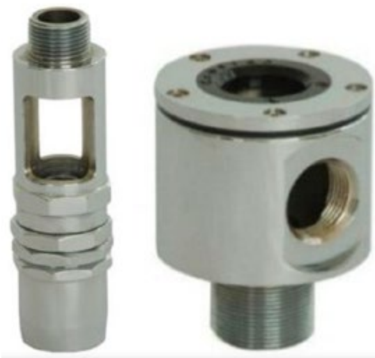
Hairy, & Indicator Glass Sizes: 3/4" , 1"