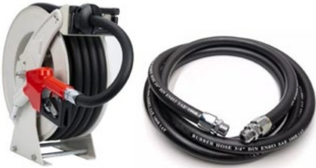
Hose Reel, & Hoses Sizes: 3/4" , 1" , 1 1/4" , 1.5"