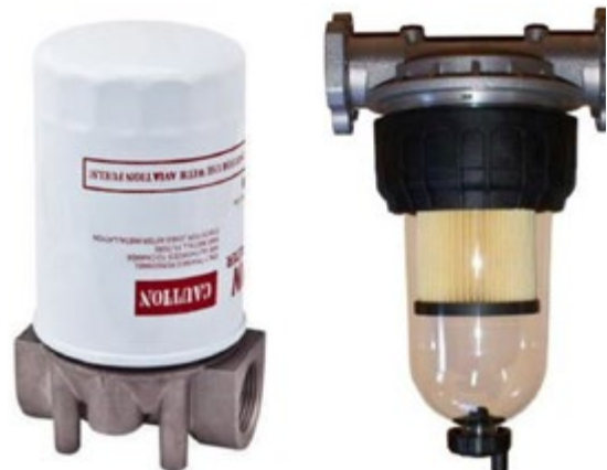
Impurities & Water Captor Filter Sizes: 3/4" , 1"