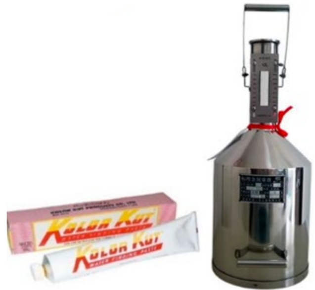
Calibration Tank, & Water Revealer