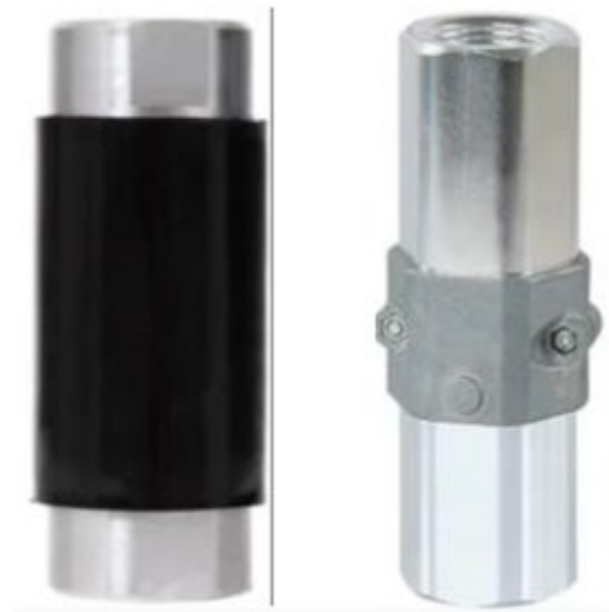
Breakaway Sizes: 3/4" , 1"