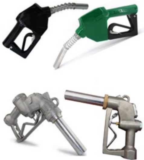
Automatic, & Manual Nozzles Sizes: 3/4" , 1/2" , 1" , 1.5" , 2"