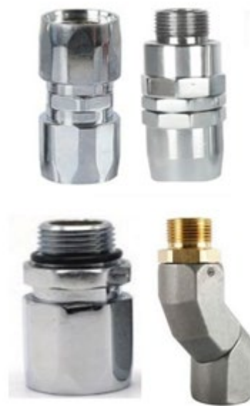
Hose Connection Coupling Sizes: 3/4" , 1"