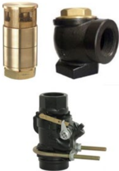
Valves Sizes: 1.5" , 2"